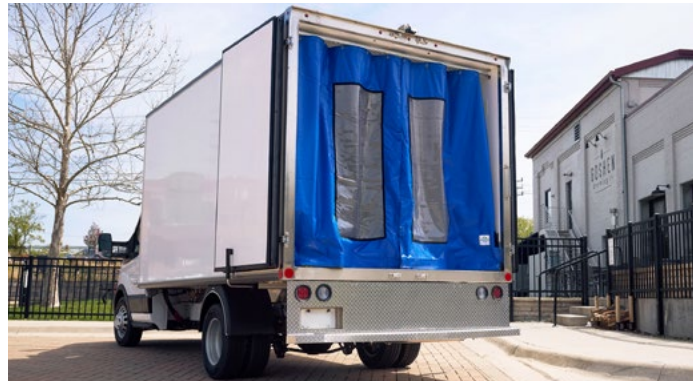
Insulated body with two swing back doors