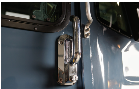
Heavy-Duty Ergonomic Door Handle