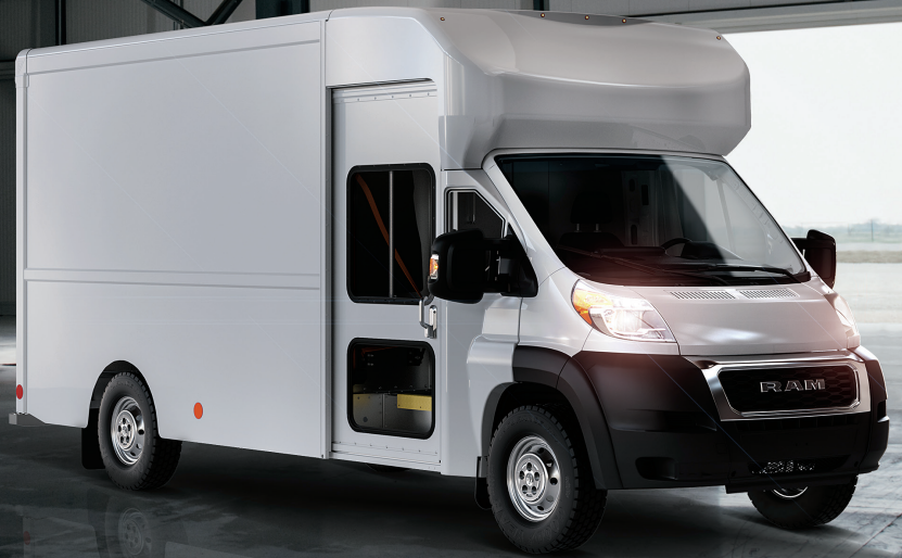
Push button bulkhead door

DRIVING TOWARD THE FUTURE. WITH MORE VELOCITY THAN EVER.