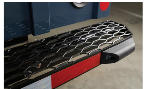
Grip Strut Bumper

Utilimaster can help design the perfect R2 upfit to meet the specific needs of parcel delivery, linen & laundry, utility service, food & beverage, and contractors. From shelving and cabinets, to bins and partitions, to safety packages and exterior compartments, we offer a wide range of high quality upfit components to help make your job easier.