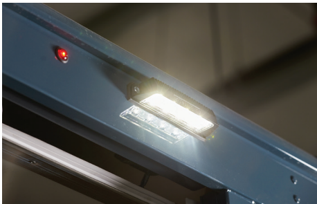
LED Scene Lights