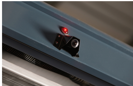
Back-up Camera and Sensors