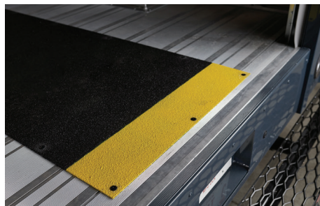
Sure-Foot Center Aisle