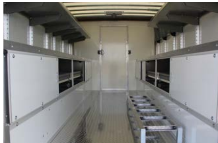
Internal access compartments