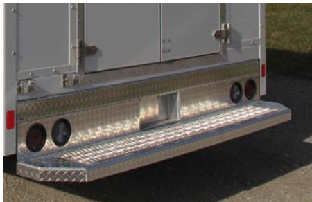
Aluminum grip strut bumper