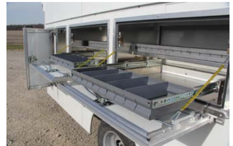
Slide-out compartment trays