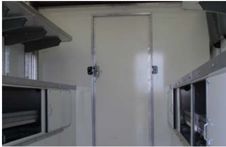
Full-height bulkhead door