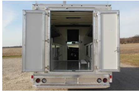
Extra wide 50" rear door opening